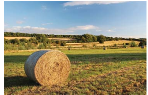
6 Tailby Meadow to the south of the proposed development area to be retained