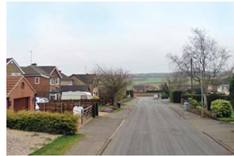
5 View from Ise Vale Avenue facing south towards the Ise valley and the hill on the other side of River Ise