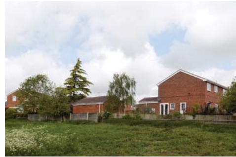
4 Existing fencing backing onto the proposed development area