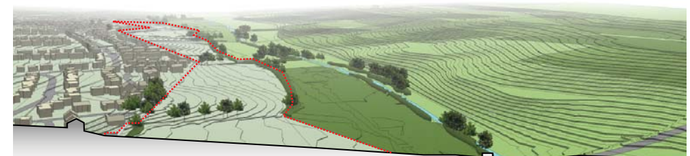
Perspective section looking east