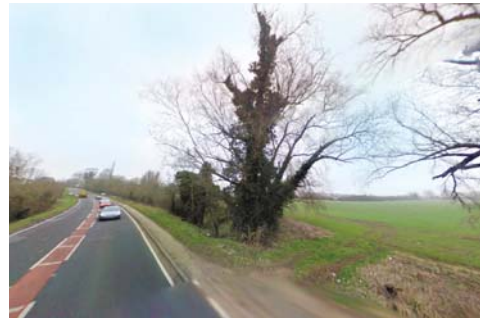
1 View into proposed development area from Rothwell Road

The southern edge to Desborough between the natural and built environment overlooking the beautiful Ise Valley.