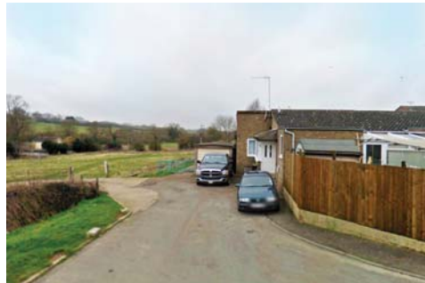
3 Existing view between open spaces and built area at the south end of Valley Rise