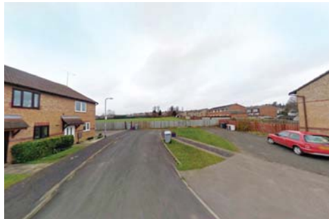
2 View into proposed development area from Sycamore Drive